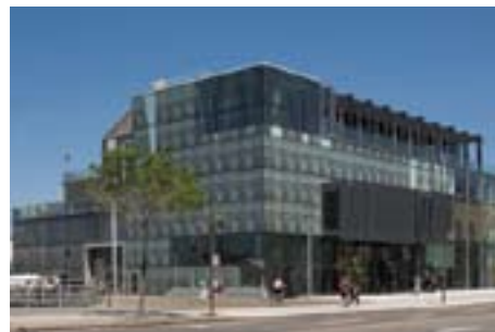
Parks Canada Discovery Centre at Québec

The new Parks Canada Discovery Centre will open its doors to the public in the summer 2010. An exhibit entitled “Moving with the River” will tell the story of the millions of travellers from near and far who passed through Québec City, inspired by the dream of a new life in Canada. The exhibit will present key events that marked the early days of settlement. Visitors will discover that it was truly here, along the banks of the mighty St. Lawrence, that the country was born. Visitors will learn about the land of the First Nations peoples, the 1603 treaty as recounted by Champlain, the destiny of the “Filles du roi”, and the history of Québec City, the gateway to North America for generations of immigrants.