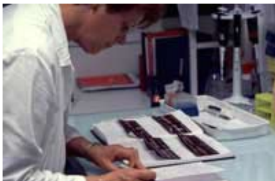
Genoscope, Centre for Genetic Research