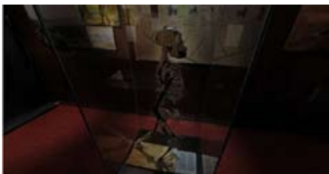
Lucy at the National Museum

1001wonders.org (formerly world-heritage-tour.org) is listing 1001 cultural and natural sites around the world and is documenting them in panophotographies - immersive and interactive panoramic images. Today 272 sites have been visited : 253 are available on this web site, 19 are currently in post-production and will soon be uploaded. Altogether there are 2097 panophotographies. This project is building a museum atlas which is interactive, immersive, without border and for educational purposes. It is also a testimony and a documentary inventory of natural and cultural sites to future generations.