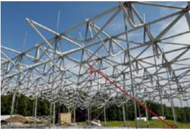
Montage du prototype en juillet 2008