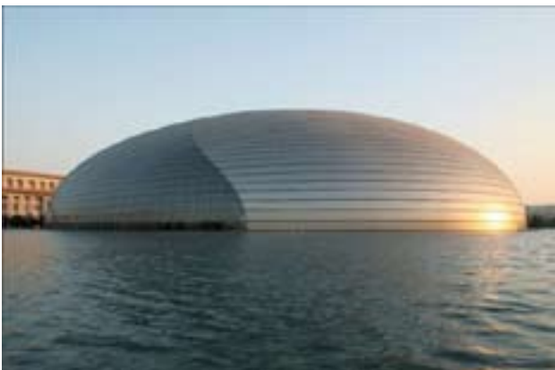
Le Grand théâtre national de Pékin, dessiné par Paul Andreu