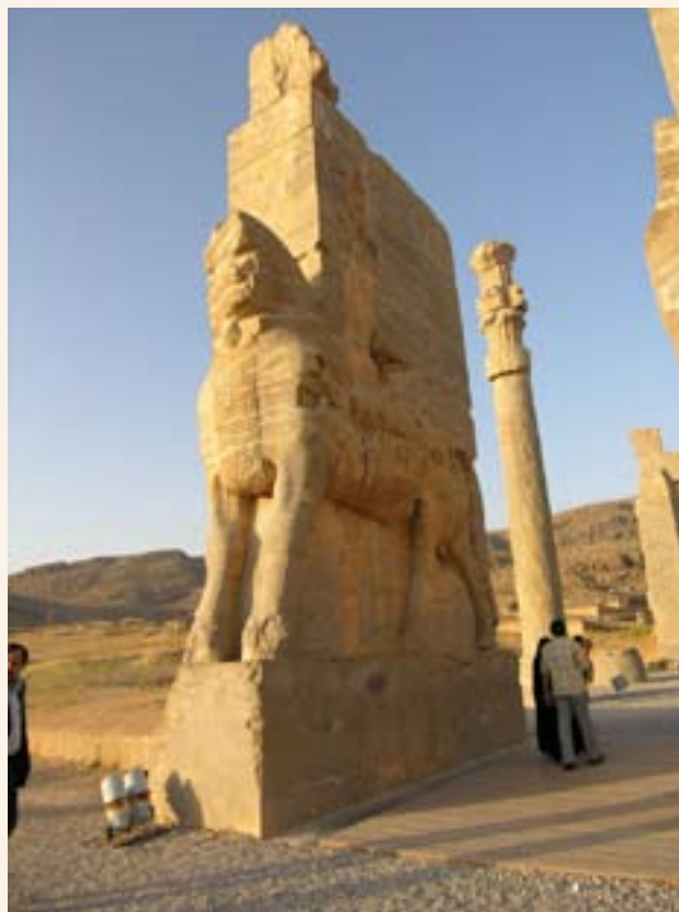
Iran (Islamic Republic of), Persepolis, © UNESCO / F. Bandarin

World Heritage Centre. News & Events. Published: 19-5-2008