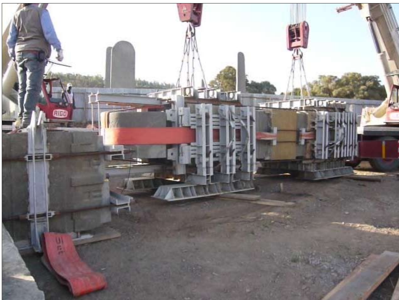
Aksum positioning of stele (01/03/2008)