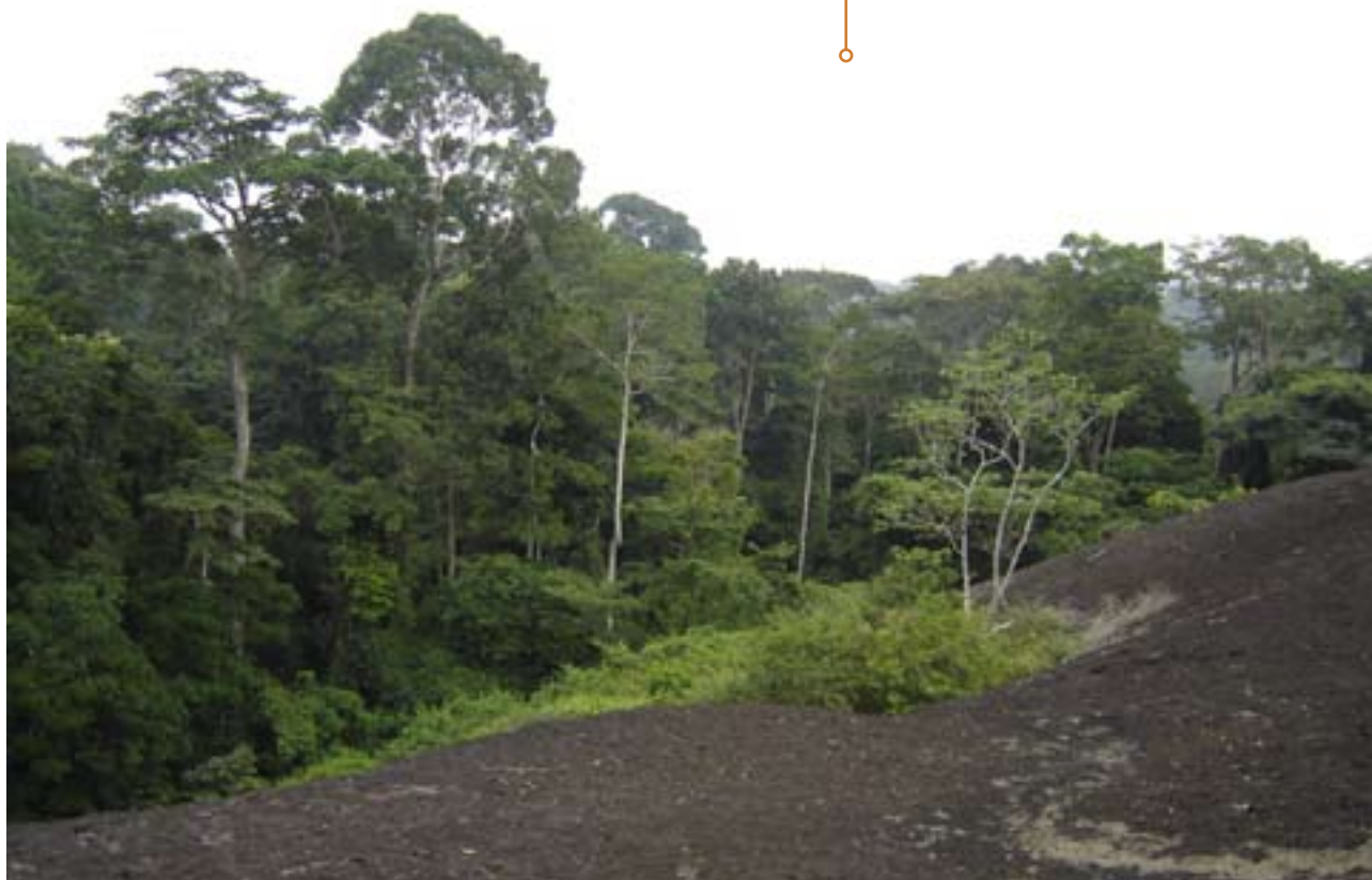
Dja Faunal Reserve

World Heritage Centre. Activities. France. Published: 28-09-2007